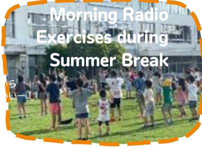
A refreshing morning!