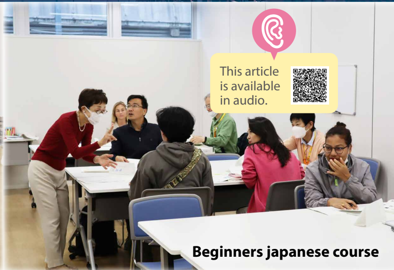
Beginners japanese course