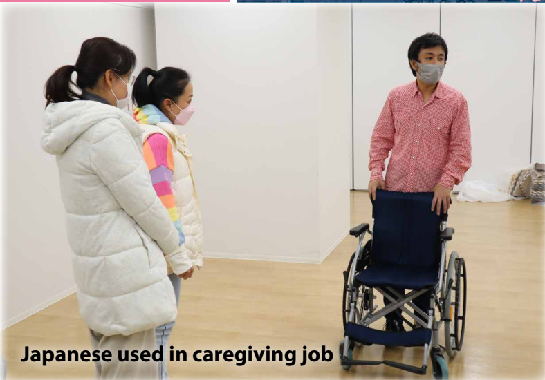
Japanese used in caregiving job